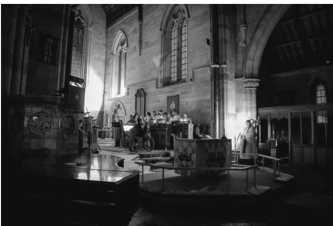
ABOVE: the gloom at St Paul's is deliberate! Lit only by candles, the choir sing an item at the recent Mission Area service for Advent