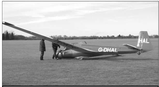
ABOVE AND BELOW: proof that St Hilary's is a high-flying church? Church regular Don Milne takes to the skies - see details at the bottom of the page!