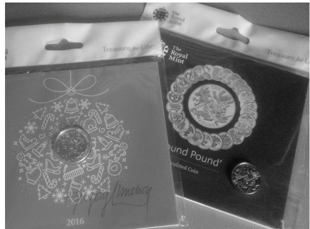
ABOVE: Designed in St Asaph, minted in South Wales and sold in aid of St Doged's! The two coins designed by the bishop have attracted attention from collectors and are selling well.